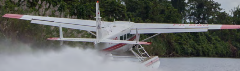
The float plane taking off on the river by the village of Sinimburu

This will be our last newsletter as an MAF family. We have been with MAF for over ten years and are very grateful for all of you who have supported us throughout our journey.