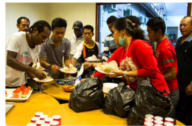
Above: In April we had a goodbye lunch for all the national employees of MAF together with two other families who were also leaving.

We are grateful for the new friends they've already made and for the assistance both schools have provided as the kids get settled into their new lives. We are also thankful to our home church in Aldergrove for their warm welcome to our family.